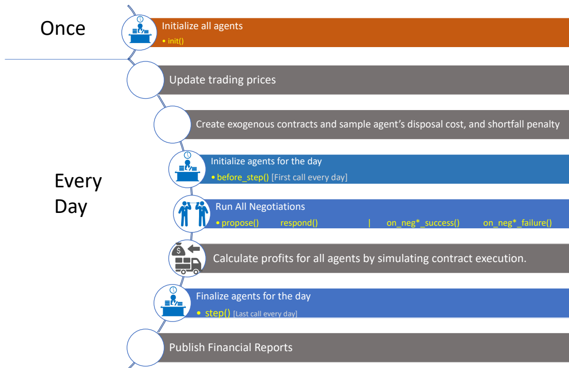
Figure 3: Order of execution of events during a simulation.

All SCM agents implement an initialization function and a step function. The former is called by the simulator to initialize agents’ behavior, before day zero. 11 After initialization, the simulator repeats the following loop every day, which calls the agents’ step functions, among other things (see Figure 3):